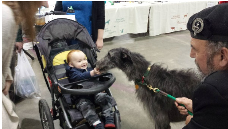
The Scottish Deerhounds represented!