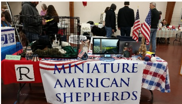
Beverly Chang's minis

Ring practice is starting up again - watch the yahoo list for announcements!