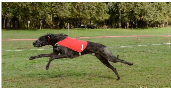
Running the oval track

Deerhound Colin finished his Oval Racing championship Sunday February 15. This boy loves to race! He's exuberant the whole weekend, smiling and wagging at everybody. The only downside is over night, when The Nose keeps checking to see if it's time yet to go to the field.