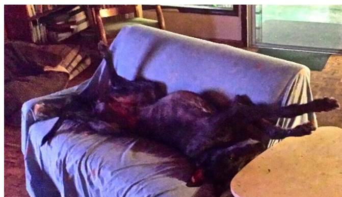
Running the "victory lap" at home on the couch after a racing weekend