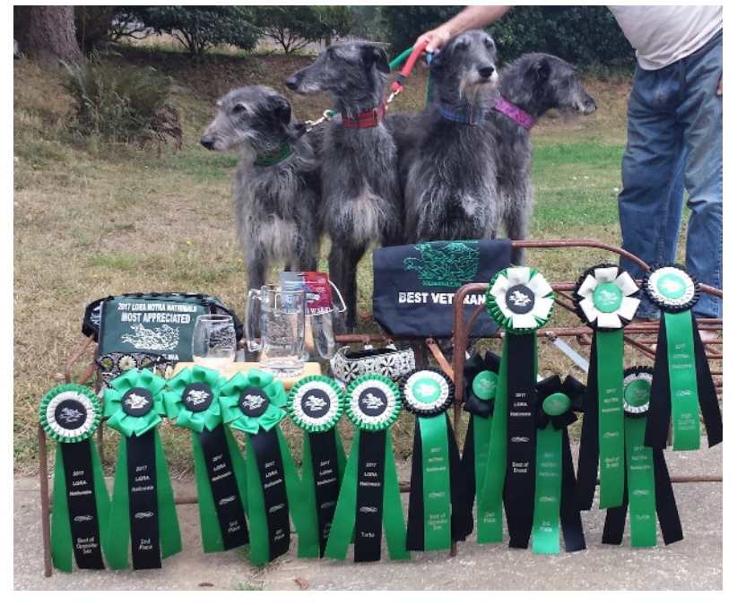
Photo: Tillie (CH Sindar Tillicum of Jeffcairn SC), Neida (Fernhill's Oneida at Jeffcairn SC), Colin (DC Fernhill's Colin CGC SC SGRC ORC), Opal (CH Fernhill's Opal at Jeffcairn SC)

We took our four Deerhounds to Washington State for the LGRA (Large Gazehound Racing Association – straight racing) and NOTRA (North American Oval Track Racing Association – oval track) Nationals the weekend of September 9 and 10. Since we had the whole Deerhound entry, we brought back all the awards, which were many and generous at this event. Our big, strong girl Opal won both days, finishing the last oval race with a spectacular sprint, leaving the others in her dust. Colin and Neida battled it out for second, and old lady Tillie was happy be able to run one straight race on Saturday. The organizers had to change the venue to another part of the state at the last minute, due to fire and smoke in the Columbia Gorge. They pulled it off spectacularly, and we enjoyed a beautiful, smoke free field with a stunning view of Mt. Rainier.